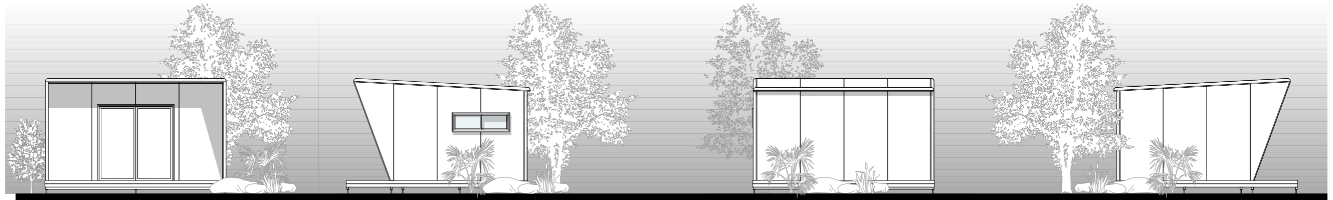
02 Elevation 1:100